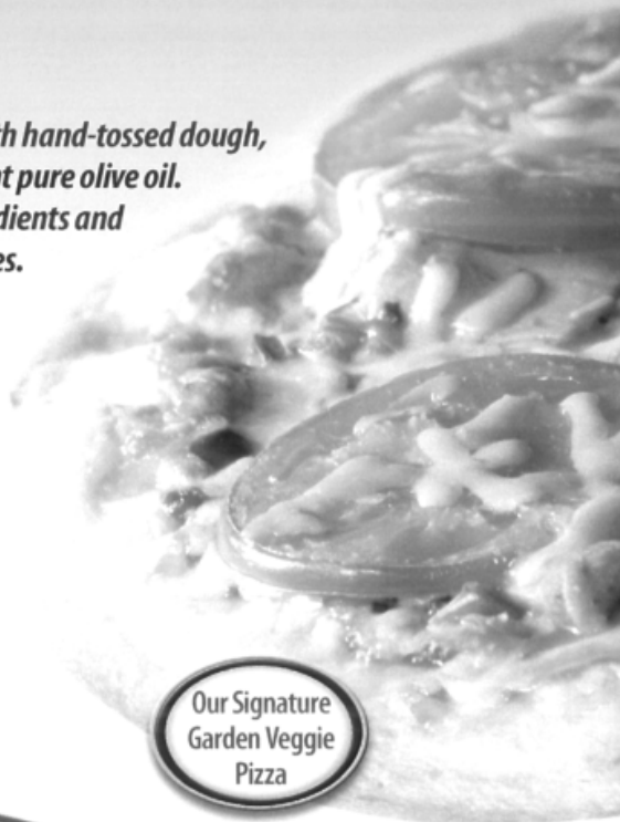
Our Signature Garden Veggie Pizza